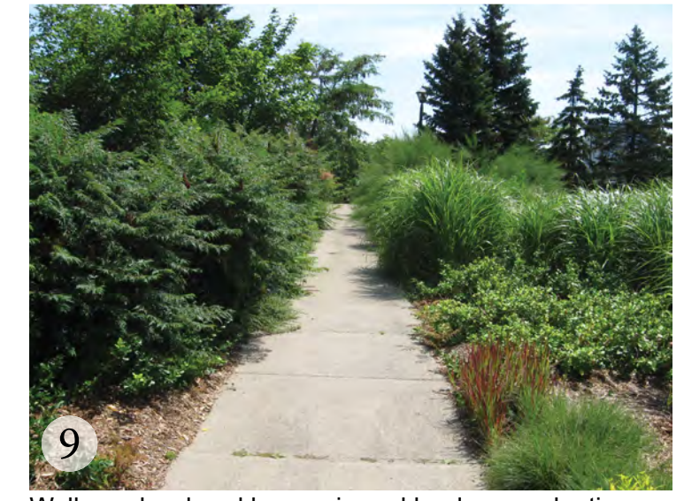
9 Walkway bordered by manicured landscape plantings. Plants are encroaching on walkway, narrowing access and visibility.