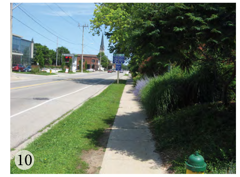
10 Sidewalk along Grand Avenue (view north) - Overgrown and narrow, lacks sense of entrance to walkway