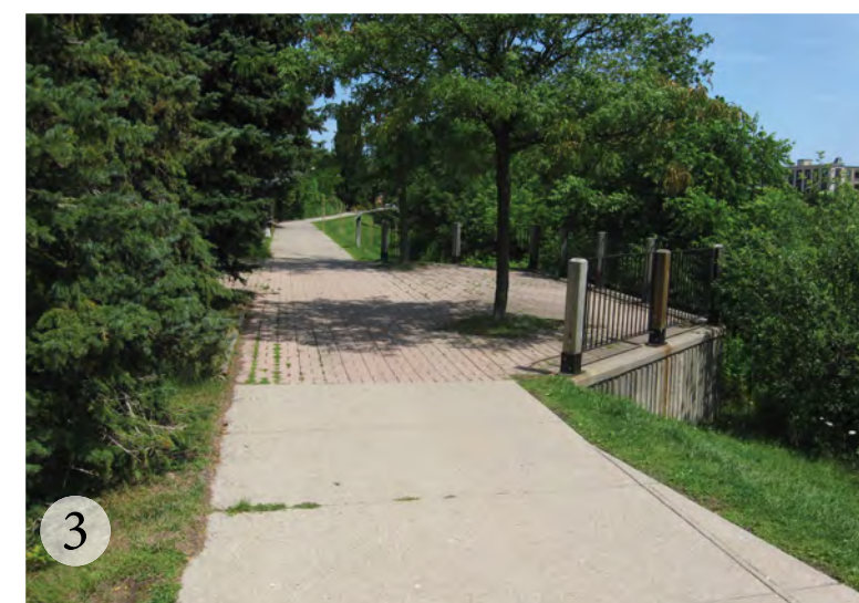
3 River walkway view approaching lookout area.