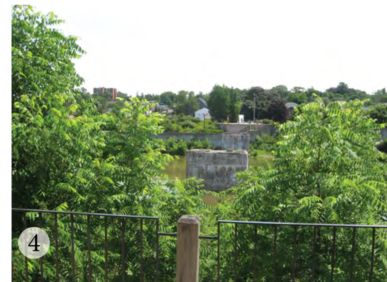
4 Lookout area - View of proposed river crossing.