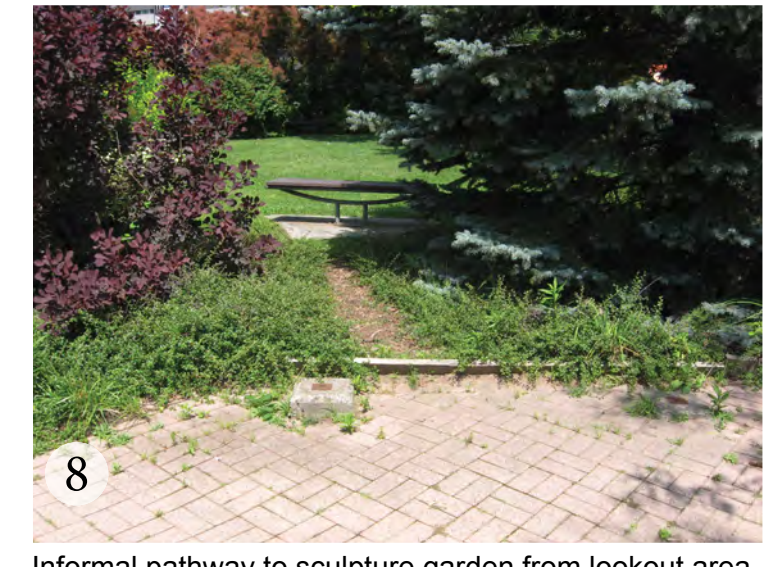
8 Informal pathway to sculpture garden from lookout area.