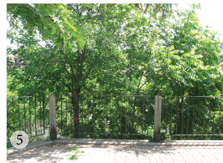
5 Lookout area - Views to river blocked by vegetation.