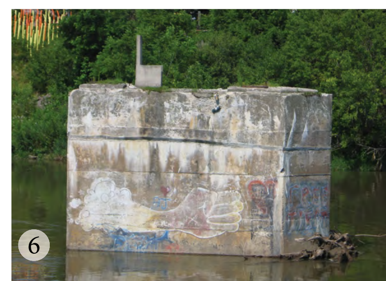
6 Existing bridge pier in river.

WALKWAY & ENTRANCE FROM STREET Provides a direct and accessible route to the proposed pedestrian bridge. Walkway is overgrown with plant material, poor sight lines. Entrance and walkway are narrow and uninviting. RECOMMENDATIONS: Widen existing walkway surfacing and create strong entrance to invite users into the space. Introduce lower growing plant material 1.0m back from edges walkway to improve sight lines.