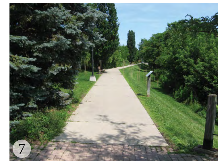
7 Looking north of the lookout area. Location of interpretive sign, bench and temporary public art installation.