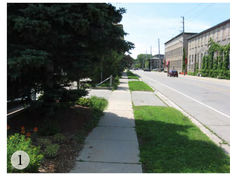
1 Sidewalk along Grand Avenue (view south) - Narrow and lacks sense of entrance to walkway/proposed pedestrian bridge