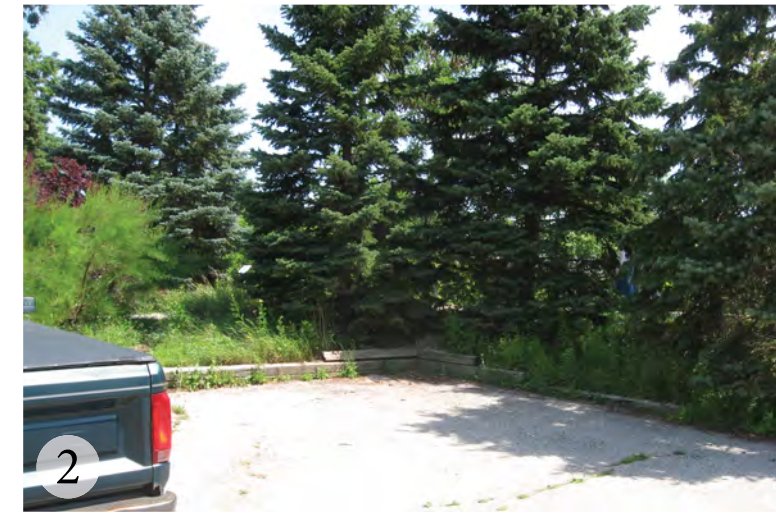
2 View from adjacent private property parking lot. Potential staging area for bridge crane during construction. Viewing area/pathway will need to expand to abut parking area, note grade differences and trees.