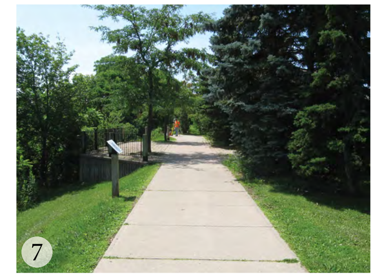
7 North of lookout area (looking south). Location of interpretive sign, bench and temporary public art installation.