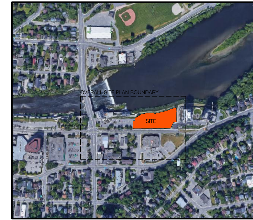
2 KEY PLAN A100 SCALE: NTS