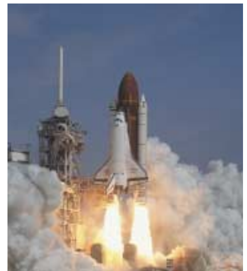
Cambridge based COM DEV is a leading global designer, manufacturer and distributor of wireless infrastructure and space satellite hardware.

COM DEV International Ltd. (www.comdev.ca) based in Cambridge, Ontario, is a leading producer of wireless infrastructure, as well as the largest Canadian-based designer and manufacturer of space hardware subsystems. The company has two divisions: COM DEV Space and COM DEV Wireless that operate facilities in Canada, the United States, China and the United Kingdom.