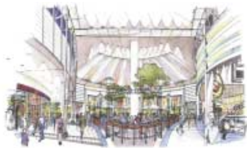
Cambridge Centre - Food Court

The new Sears department store alone will comprise 142,000 square feet and will create approximately 150 jobs.