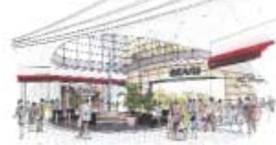
Cambridge Centre - Sears

Cambridge Centre, located on Hespeler Road is adding a further 300,000 square feet of shopping space at a cost of $58-million. Construction is underway adding a Sears and Sport Check stores, as well as a new NHL-sized ice rink, new food court,