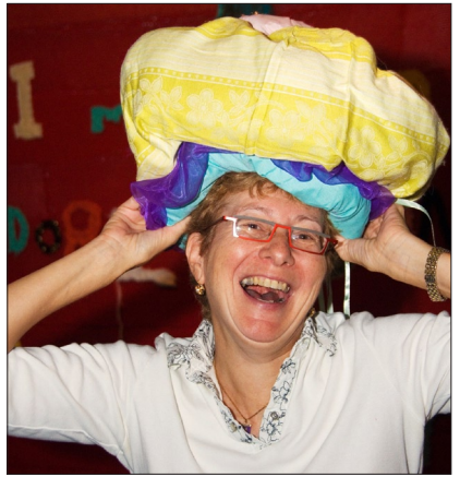
Art is serious business, Folks...