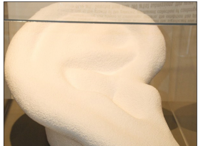
"Lifetime Supply", ear made out of Q Tips