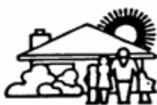
Greenway-Chaplin Community Centre