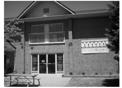
Centre boundaries are Shantz Hill, Limerick and Fountain Street

18+ Fridays, 7-9pm Jan 14-May 27 2011 $20.00 for March, April and May Or $3.00 drop in fee Please register at the Community Centre Maximum of 15 confirmed registrants to have program run