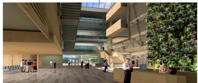
Artist rendition of the interior of the CAB with proposed green wall.

Key features include a green wall, green roof, grey water, and complete T-5 lighting system incorporating natural light.