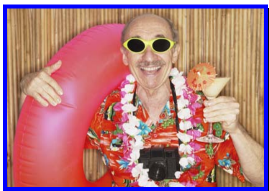
Enjoying the Fun of Theme Days