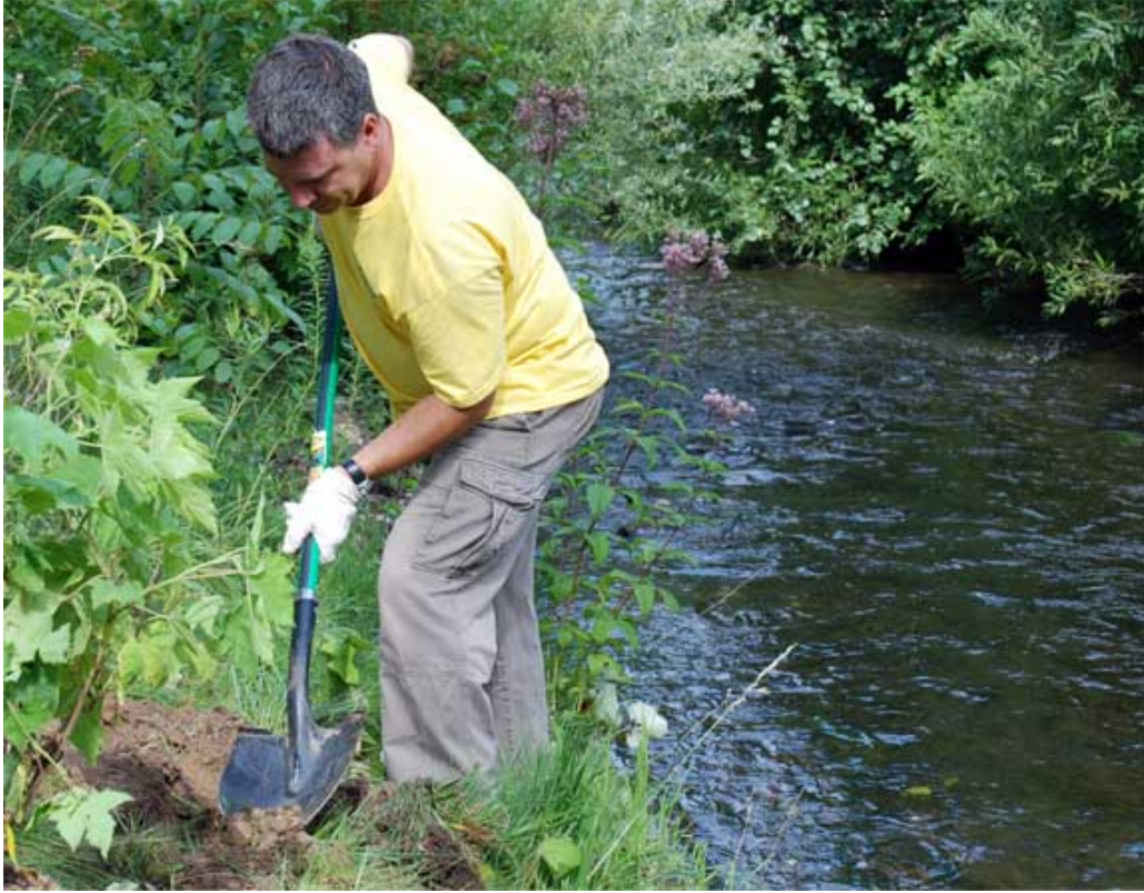
(Below) Cambridge Environmental Stewardship Trailer