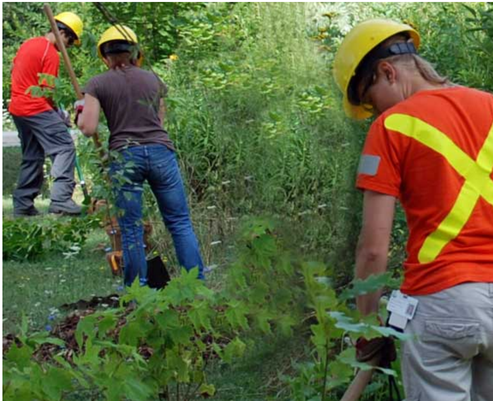
Above Photo: Mill Creek Stewardship Rangers