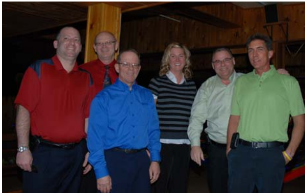
Bowl for Kids Sake