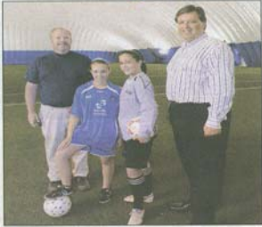
Now in the final stage of construction, the COM DEV Soccer Dome puts a roof over the heads of Cambridge Youth Soccer .....Page 10

10 - August 2008 - BUSINESS TIMES - Serving The Business Communities of Cambridge, Guelph, Kitchener & Waterloo