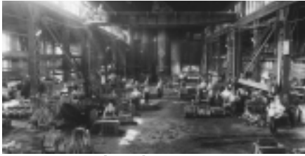
The current Southworks site was originally a foundry operation at the turn of the century.

Whether relocating, expanding or forging new opportunities, Cambridge is a great place to do business. Located within an hour's drive of Metropolitan Toronto, Cambridge offers everything you need for establishing or growing your business success.