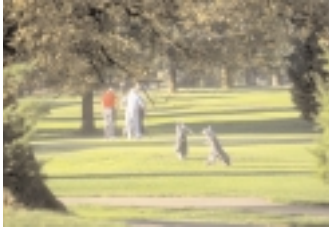
Recreational options are all part of quality-of-life Cambridge offers. There are 14 golf courses within a 30 minute drive of the City.

Whether relocating, expanding or forging new opportunities, Cambridge is a great place to do business. Located within an hour's drive of Metropolitan Toronto, Cambridge offers everything you need for establishing or growing your business success.