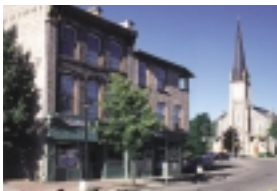
Factory outlet stores, antique shops & quaint downtown neighbourhoods provide an abundance of shopping opportunities for visitors.

a great place to do business. It's also a great place to live. The City is rich in heritage and tradition. More than 100,000 people now call Cambridge home, and enjoy the daily benefits of this area's relaxed quality of life. For more information on how to grow your business or make your business home in Cambridge, please contact the Economic Development Division.