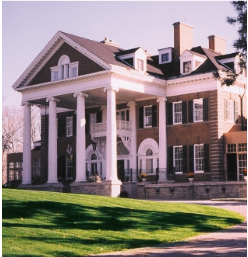
Cambridge offers an excellent assortment of accommodations for visitors travelling for both business or pleasure – from first-rate bed & breakfast establishments to hotels and luxury country inns, such as the historic Langdon Hall Country House Hotel (pictured above).

The Corporation of the City of Cambridge